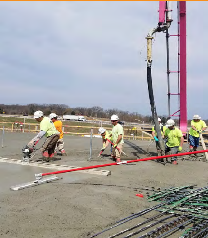
Local 464 Members from Findorff pouring concrete at the Summit Bank project in Cottage Grove.