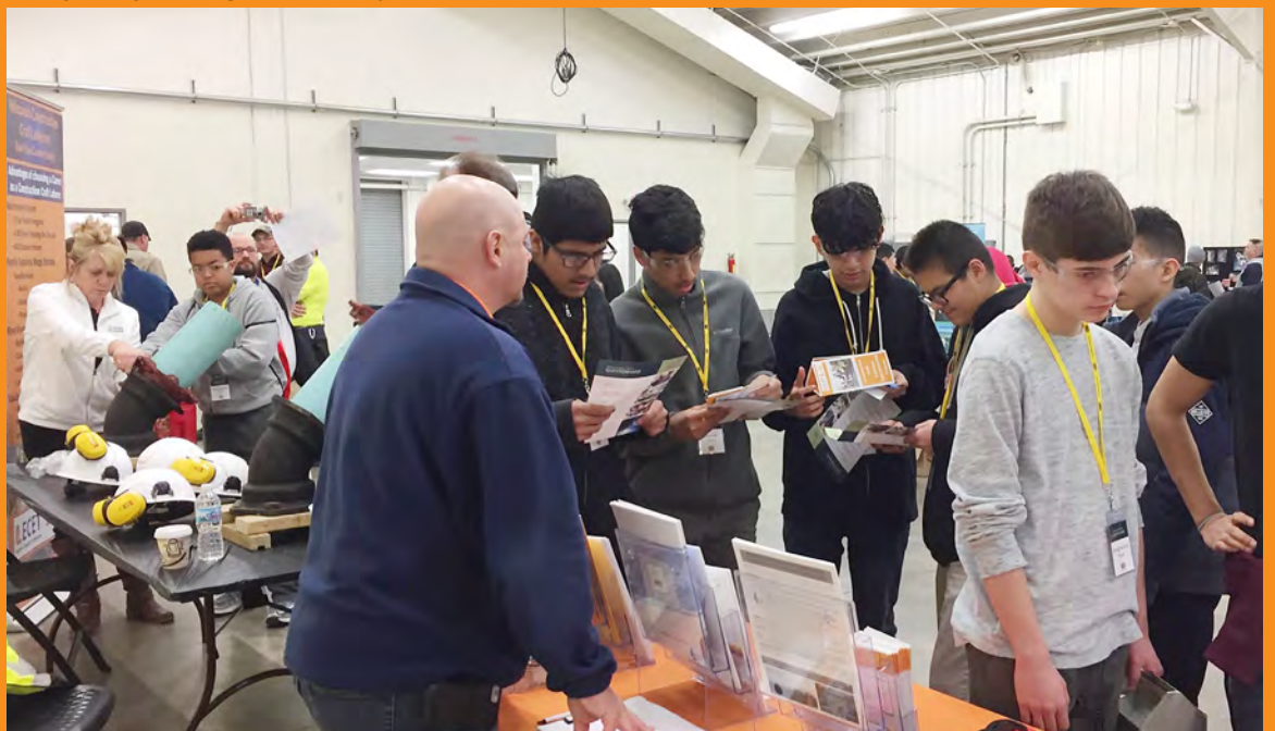
WI Laborers & LECET Staff at the Building Advantage Career Fair